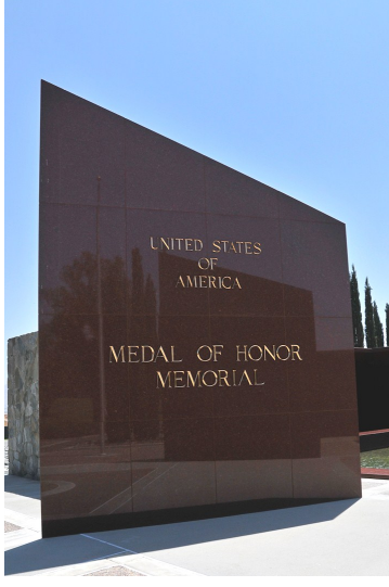
Medal of Honor Memorial at the Riverside National Cemetery