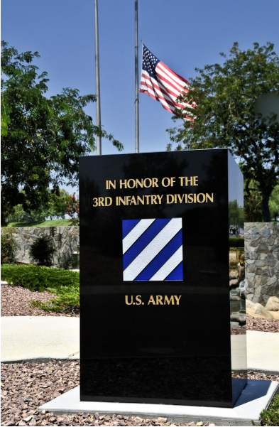
Memorial to the Third Infantry Division on LeMay Blvd.

Control (Ctrl) Click on any Photo or Link to open a full-size image in a new window or tab.