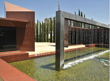
Looking southerly past the Memorial fountain

The Medal of Honor is the highest award for valor in action against an enemy force which can be bestowed upon an individual serving in the Armed Services of the United States. Generally presented to its recipient by the President of the United States of America in the name of Congress, it is often called the Congressional Medal of Honor.