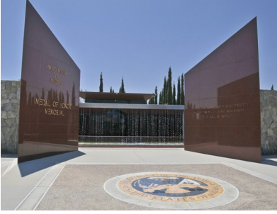
Medal of Honor Memorial at the Riverside National Cemetery