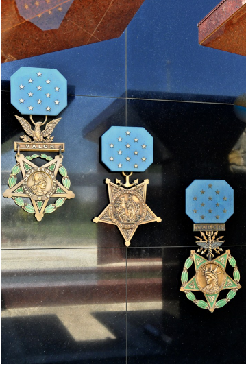
Present day variations of the Medal of Honor