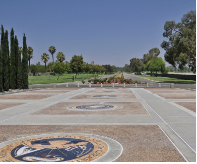
Looking northerly along LeMay Blvd. from the Memorial