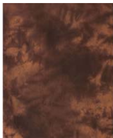
Westcott Rich Mocha