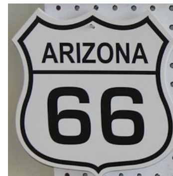
U.S Route 66 shield in Arizona

With the passage of time and as more sophisticated superhighways began to appear Route 66 was pushed more and more into the background. For a time it looked like Old Route 66 would be forgotten. Original Route 66 shields started coming down. But the old road refused to die. Massive efforts by supporters of the Historic Mother Road to protect and promote what was left of Route 66 proved successful. Today each of the eight states as well as some foreign countries has active Route 66 Associations.