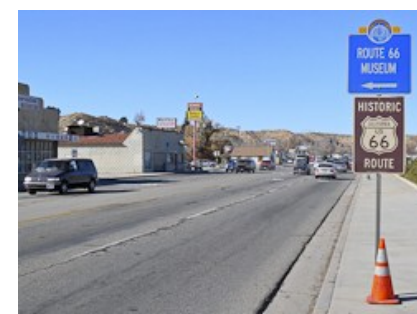
Looking West along "D" Street, in Victorville, towards I-15. "D" Street is built on the original course of Route 66.

Control (Ctrl) on any picture for a larger image