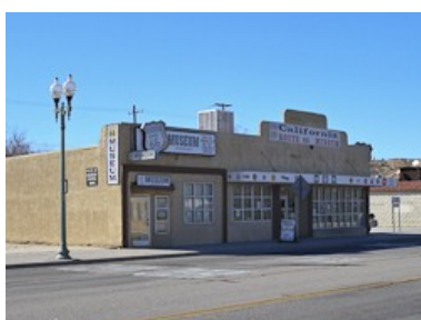
The California Route 66 Museum on "D" Street, Victorville.

Control (Ctrl) on any picture for a larger image